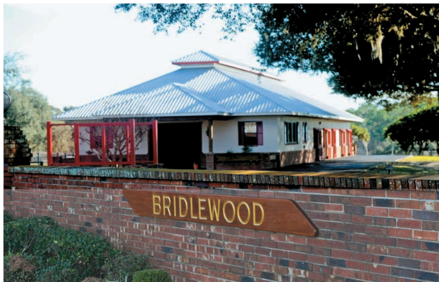
The stallion barn will be home to five stallions for the 2014 breeding season

require time for all the moving parts to settle into place.