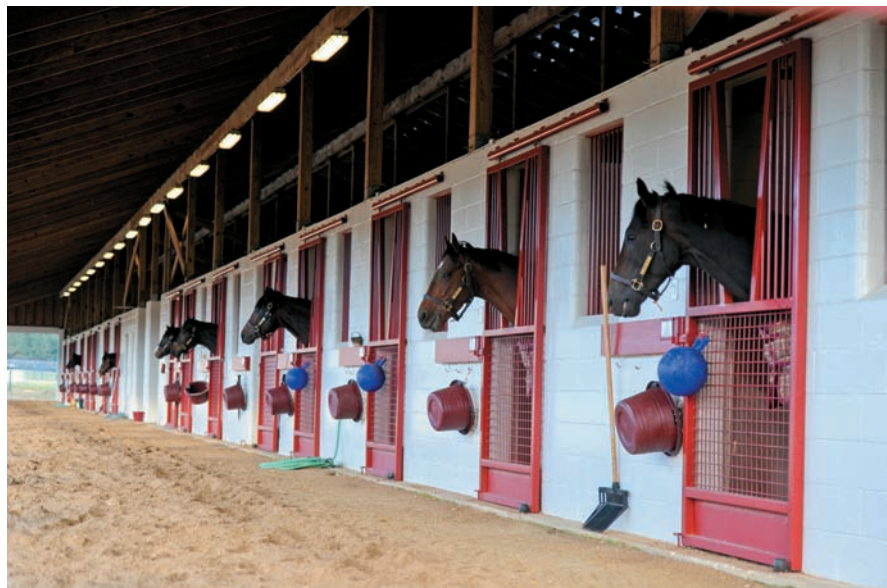
Developing a successful racing program is part of the plan for Bridlewood

hasn't lost his touch. It was fun to spend an afternoon at the races again and to visit with other owners and breeders and watch them win races. It was an exciting atmosphere, and it was a lot of fun."