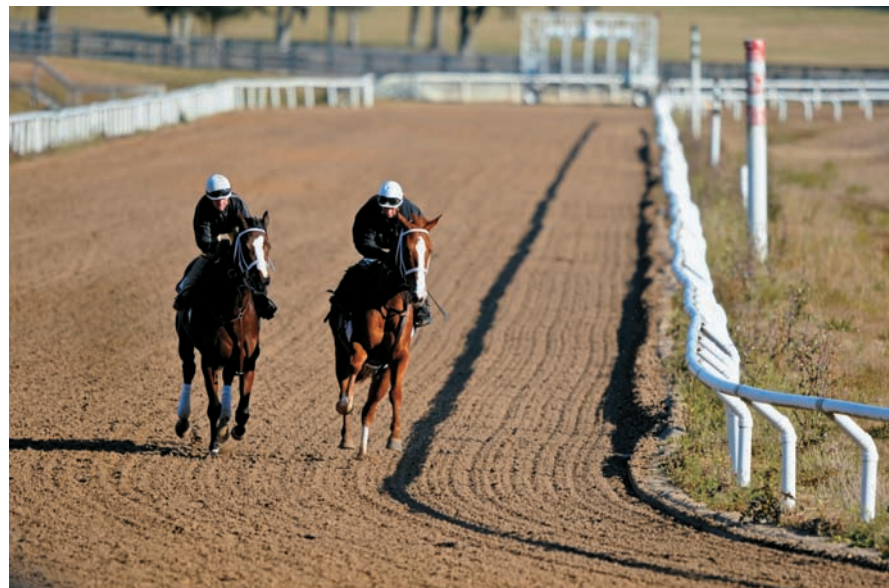
Bridlewood's training center is a key component to the 800-acre full-service facility